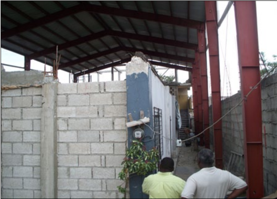
A church within a church. Spacious and raised steel structure allows for balcony to the rear and sides of building.

we still owed $10,500 for back pay for teachers. I robbed Peter to pay Paul and fulfilled that obligation; and after a day of discussion, they understood well, because most of them have family in the U.S. who are having a hard time sending money back, also. My announcement went so well, and without bloodshed, that I gathered my nerve and held it tight while I told them the next part. That was, after three months, we wouldn't be able to guarantee the gifts that we have been granting to the pastors for over forty years. I reminded them of the little generator from my "years ago illustration" and that the little generator was suffering from a lack of input. They nodded their heads with understanding and belly-ached for a short time; then as I cast a vision of a new day and a new Haiti, they began to plan how they would operate as an independent convention, without reliance on a blanc (white) mission.