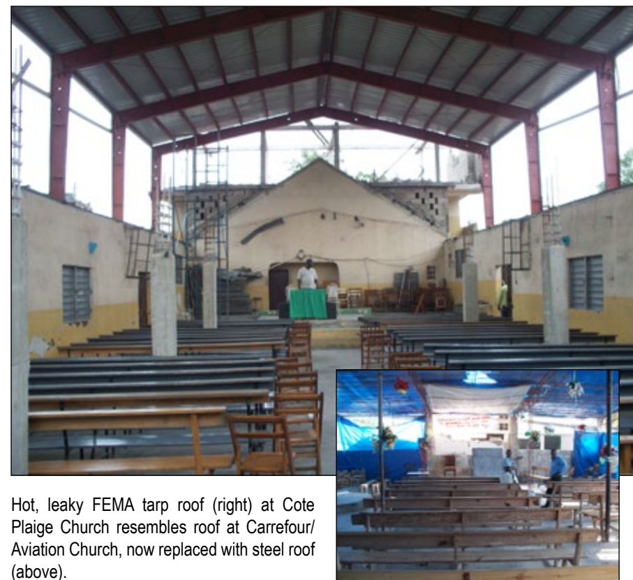
Hot, leaky FEMA tarp roof (right) at Cote Plaigne Church resembles roof at Carrefour/Aviation Church, now replaced with steel roof (above).

There have been other difficulties arising from jealous and vindictive pastors, and the greatest of these difficulties nearly caused the end of me. It grew from pride and jealousy between leaders, and eventually into hatred that led to a plot to murder. Yes, this was a hardship I never shared with you because of those still alive. I tell you now, so you might conceive the difficulties to doing what we want to do and what we know is right. The earthquake changed a lot for us. It put a heavy financial burden on the supporters of this ministry, destroyed some churches completely, while at the same time back home—the world economy skidded to a near-halt. Last year, I had an impossible task of providing help for the most desperate, while maintaining support for the teachers. They went without pay for months the year before, following the earthquake; then again last year, we couldn’t meet our obligations: I concluded that I wouldn’t put ourselves and our witness in such peril. So last March, I pleaded with you about