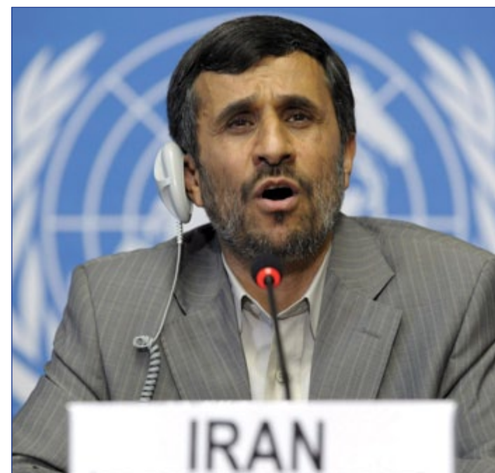
Iran’s president, Mahmoud Ahmadinejad, has vowed to destroy Israel and to bring the world under Islamic rule.

There are other psuedo-predictors such as “Galactic Alignment,” “Procession,” “Geomagnetic Reversal,” and “Planet X,” that have spawned hundreds of books and hundreds of thousands of web sites, each bringing end to what we have known as “the good life.” Whew! That’s a lot to think about!